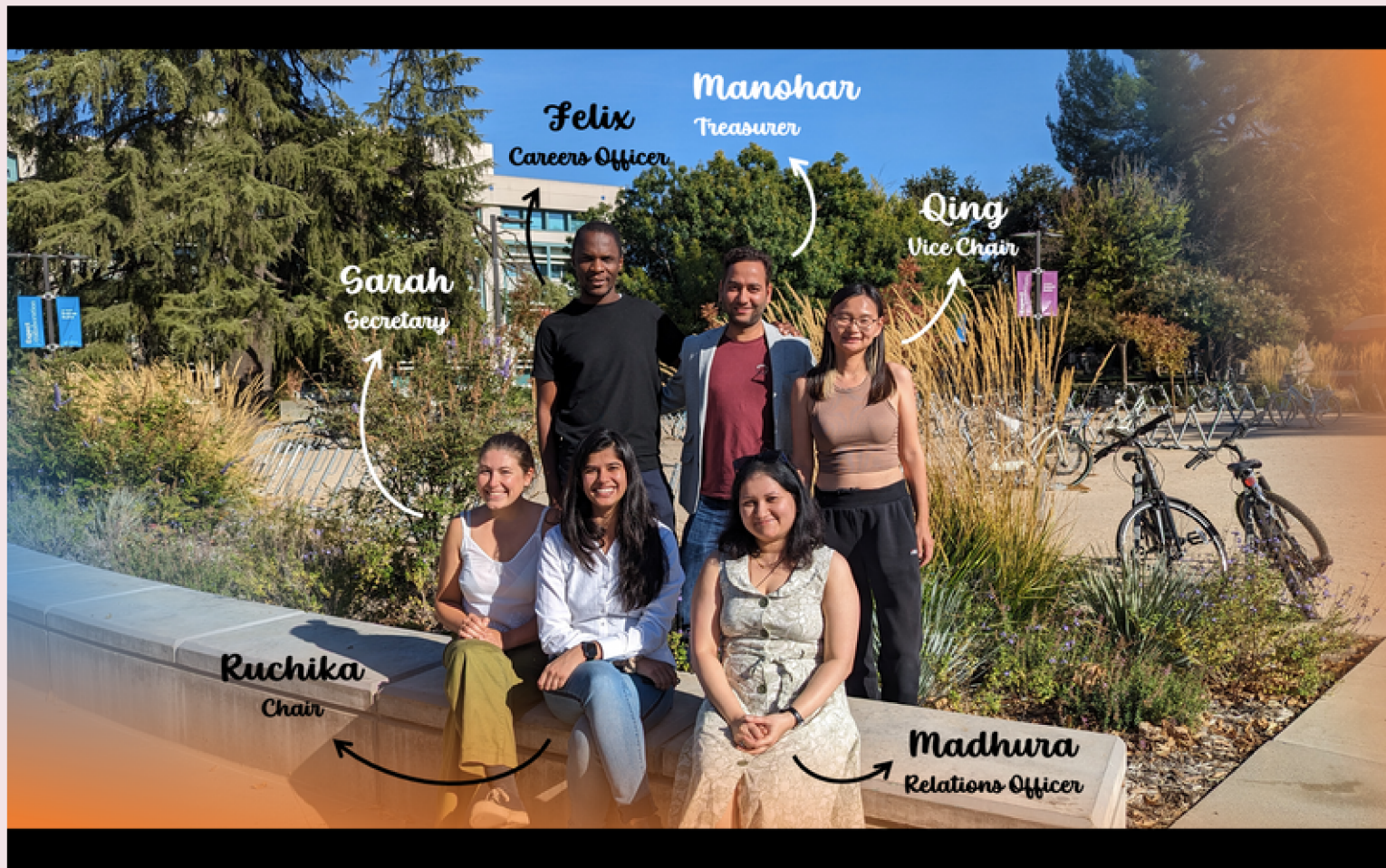
PSA OFFICERS 2023-24

UPCOMING MEET & GREET EVENTS @ 9AM THIS FALL SEASON: